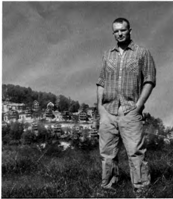
THE VIEW FROM DOWN HERE: No ridge is too steep, no mountaintop too high, no creek too pristine to build on

ritating; I have framed up quite a few of those over my summer breaks from school. What bothers me is the way developers feel the need to put a subdivision on the most beautiful piece of mountain farmland they can find. Of course, the farmers cannot be