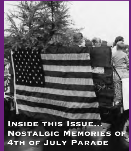
INSIDE THIS ISSUE... NOSTALGIC MEMORIES OF 4TH OF JULY PARADE

Our mission is to preserve farmland, open space and water resources in north west Waukesha County through open space preservation techniques and smart growth planning.