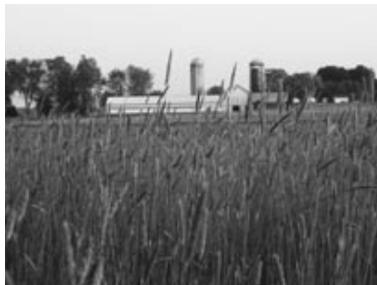
Preservation of the Zwieg Maple Acres through the PACE program.