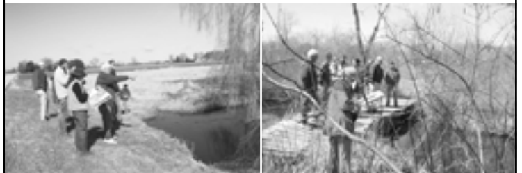
A team of wetland and stream biologists, North Lake Management District and TPC, study water quality in Mason Creek.