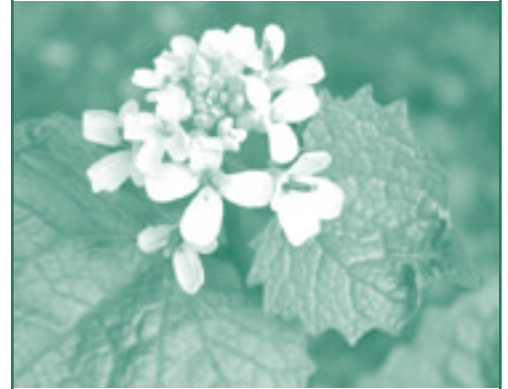
Garlic Mustard is a threat to Wisconsin's woodlands and wildlife areas.

Join us for a Garlic Mustard Pull at Camp/Quad on Wednesday, May 11th from 4-7pm. We'll bag up that nasty stuff, then celebrate with a barbeque in the warming house! Please RSVP to info@tallpinesconservancy.org .